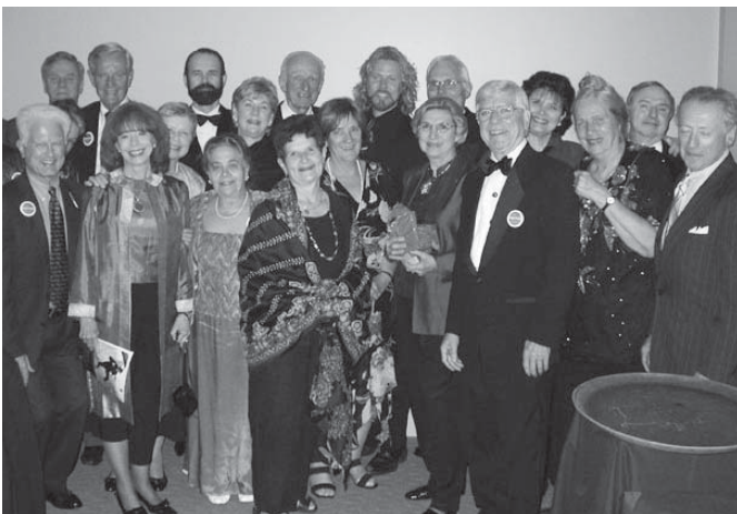
Members at Seattle Ring 2005