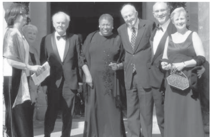
Members at the Bayreuth Festival 2005