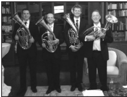
Richard Wagner would have loved the salute from four Wagner tuba players at the 200th birthday anniversary program.