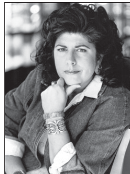
Francesca Zambello, WNO Artistic Director.