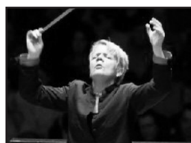
Music Director Marin Alsop