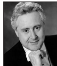
Maestro Piotr Gajewski

Piotr Gajewski , music director and conductor of the National Philharmonic, discussed conducting Wagner and the role of the orchestra in Wagner's operas. Goethe Institute. May 16.