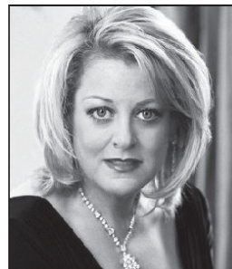
Deborah Voigt sings Isolde in WNO production.

Sunday September 15, 2013 cast party and dinner for "Tristan und Isolde" after the matinee performance. Co-sponsored by the Washington National Opera and the WSWDC. $75 for members. Magic Gourde Restaurant. Reservations required.